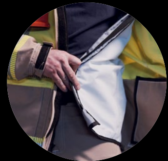
The moisture barrier can quickly be removed to meet wildland and technical rescue standards, or put it in place with a zipper system to meet technical rescue and EMS standards – so firefighters are ready for almost any situations, at any moments.