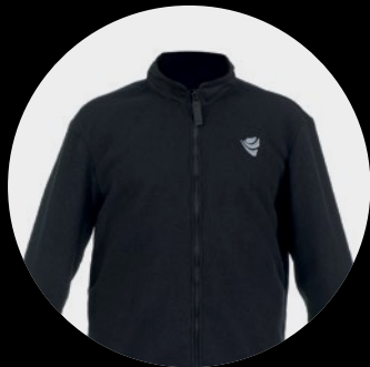
A removable FR Polar Fleece Vest is available as an optional add-on to suit all weather conditions.