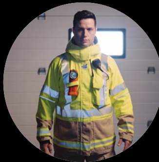
Hi-Viz ANSI 107 Trim Pattern offered as an option.