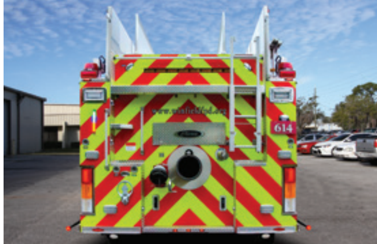
Rear dump. Shown on a commercial dry-side tanker.