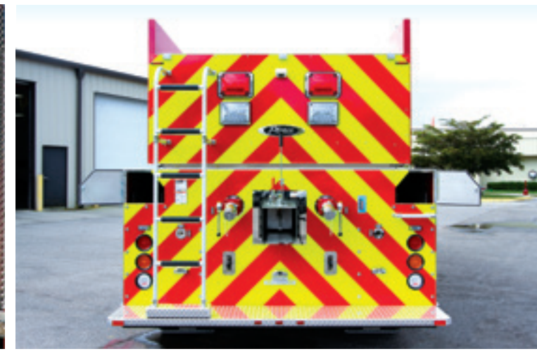
Integral suction hose storage. Shown on a commercial wet-side tanker.