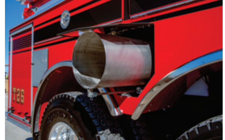
Side dump. Shown on a custom dry-side tanker.