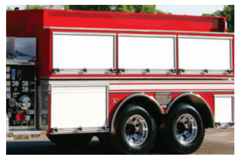
High side compartmentation. Shown on a BX™ tanker.