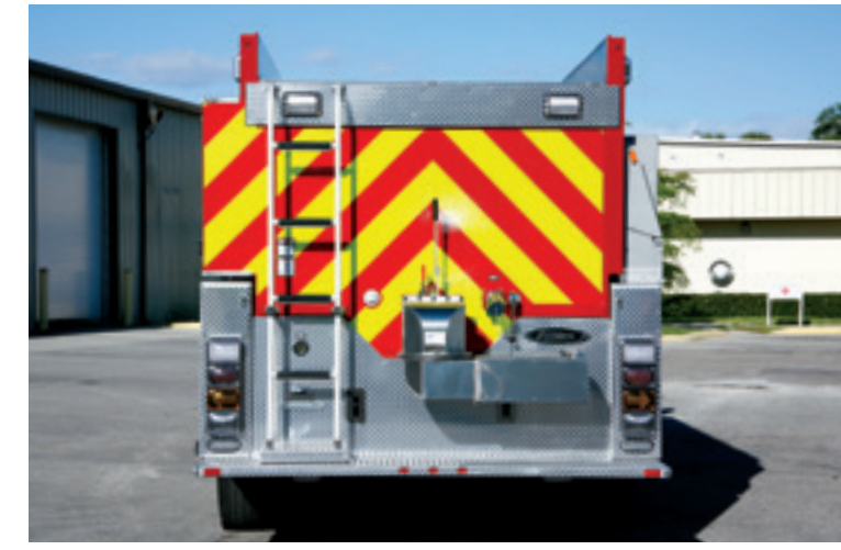
Swivel dump valve and safe access to hose bed. Shown on a BX™ tanker.