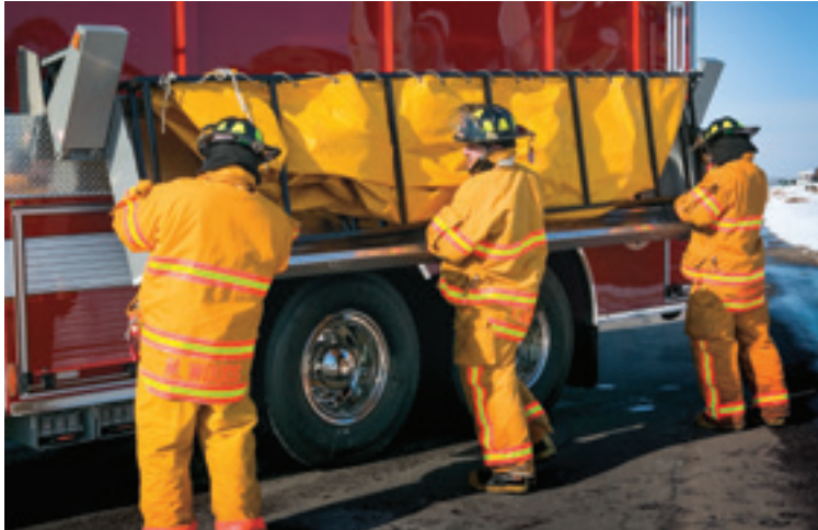
Swingdown folding tank storage. Shown on a custom dry-side tanker.